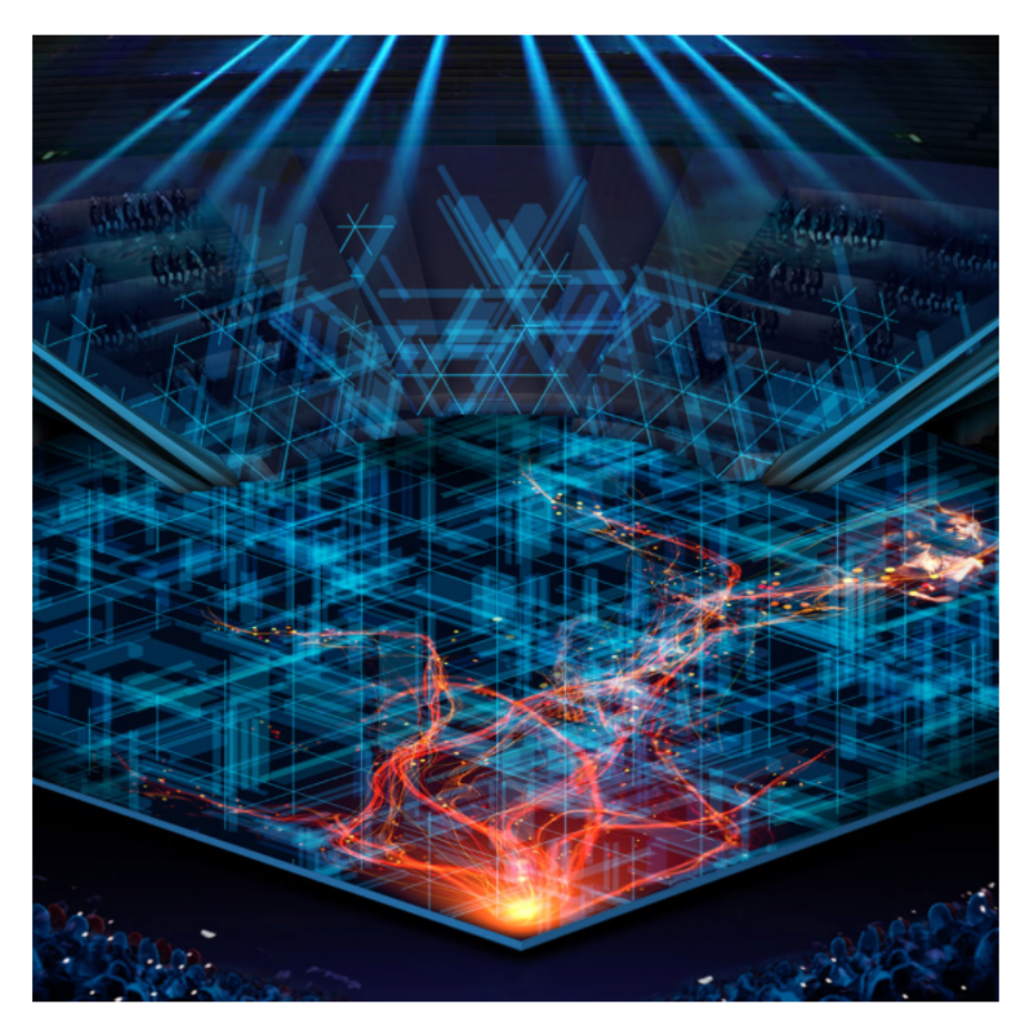
The Arena di Verona as imagined for OPERAPOP.

Intimissimi on ice: OPERAPOP runs Saturday 20 and Sunday 21 September in Verona, Italy. For more information and to book tickets, visit operapoponice.com